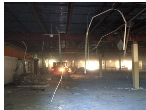
Old Music Room