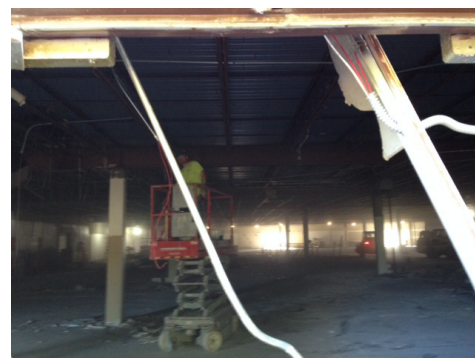
Old Science Rooms