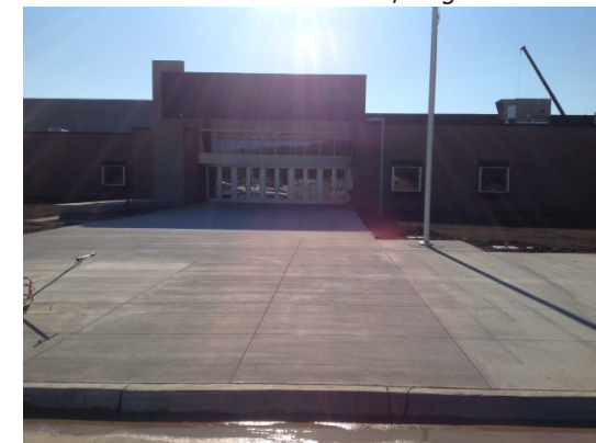
New Main Entrance 5876 Co Rd P43